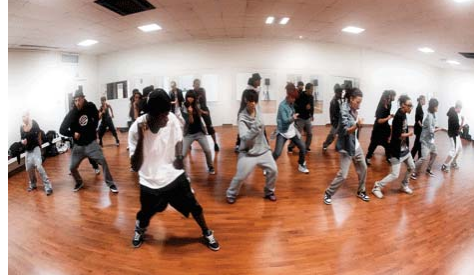
Club Kicks Dance Academy